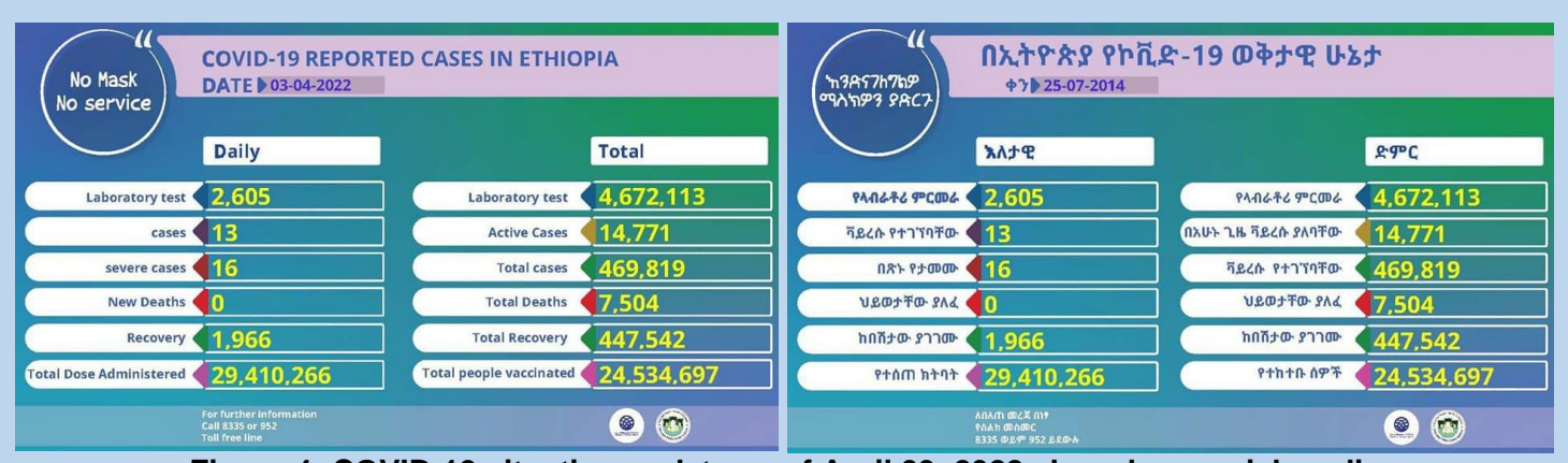
Figure 4: COVID-19 situation update as of April 03, 2022 shared on social media.