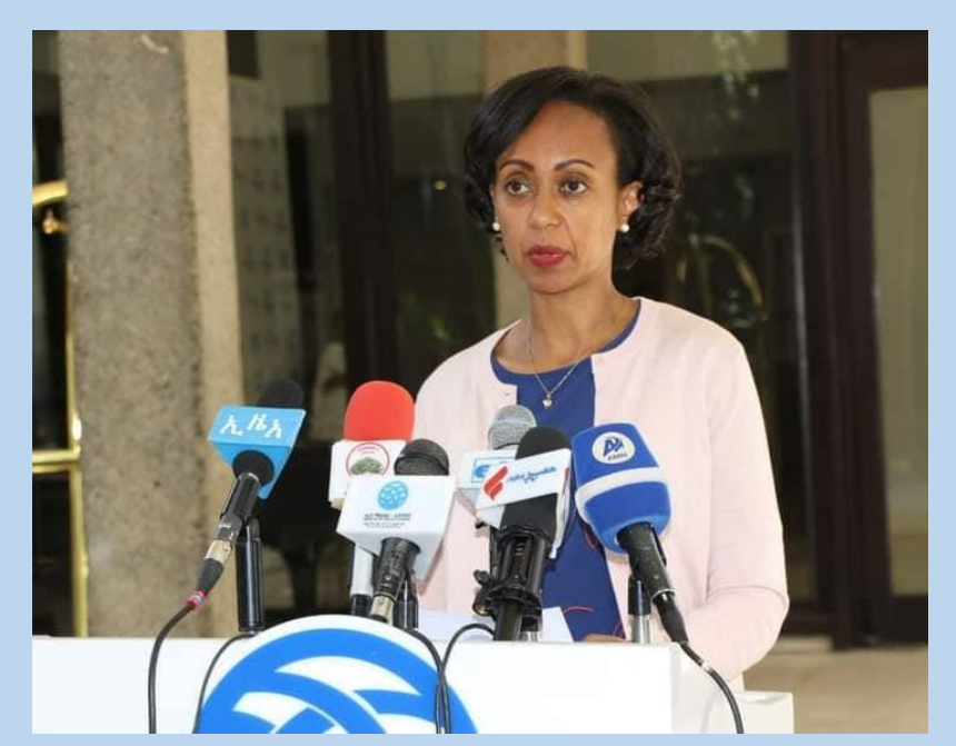
Figure 1: H.E Dr. Lia Tadesse, Minister of Health, on press release regarding the revised COVID-19 directive, April 1, 2022