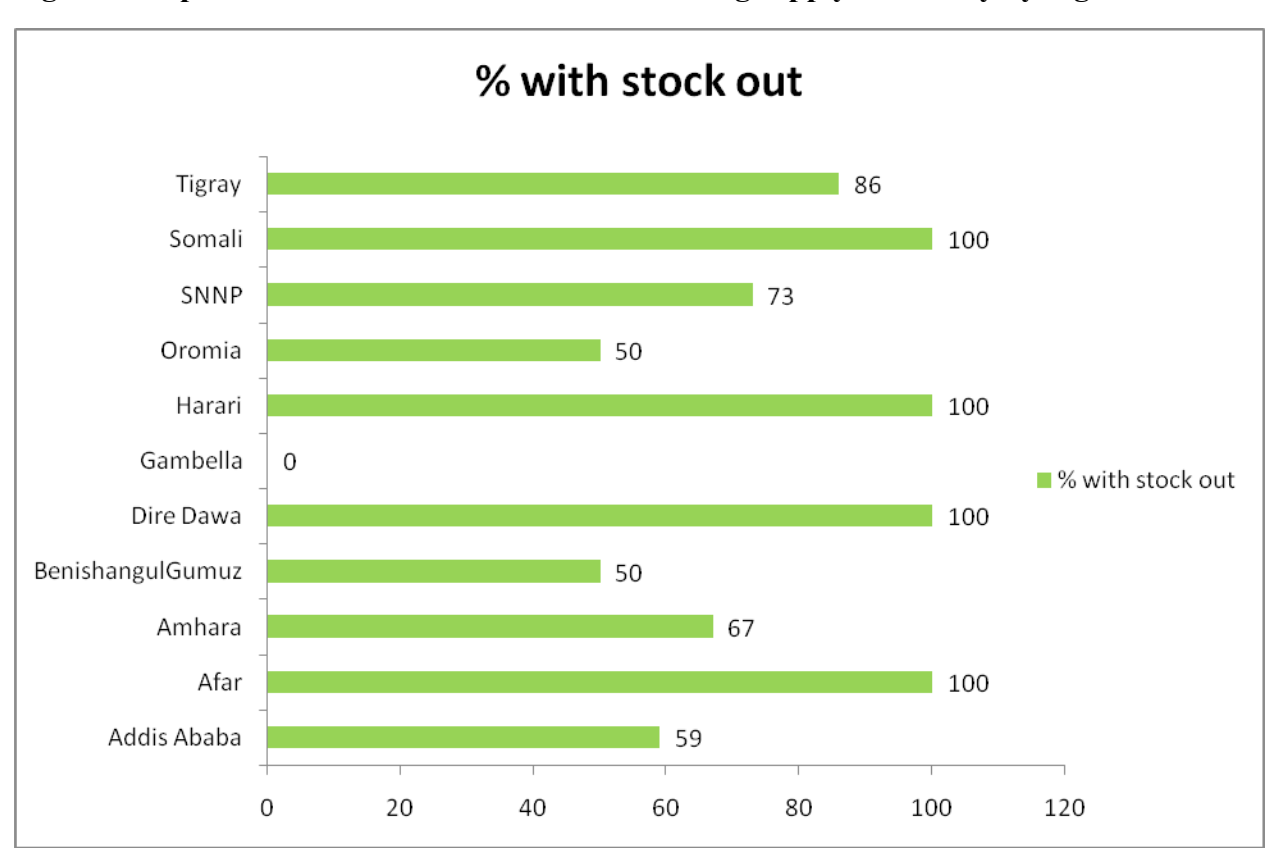
Figure-3Proportion of health facilities with ARV drug supply continuity by region

Out of the 81 surveyed health facilities, only 29 (36%) reported that they did not have stock out of any of the ARV drugs over the 12 month preceding the survey and this is alarming. When stock out disaggregated by level of health facilities, 39 (66%) hospitals and 13 (59%) health centers had stock out of one or more ARV drugs. Except in Gambella, health facilities in all other regions had ARV stock out of various level (Table-2), precaution should be taken in interpreting this as some regions are represented by only one or two facilities.