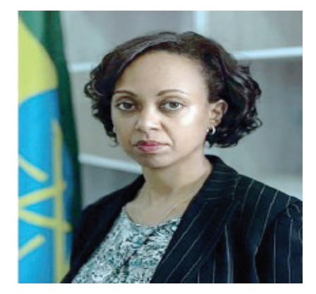
H.E.Dr. Lia Tadesse Minister of Health, Federal Democratic Republic of Ethiopia

The pivotal role of the health laboratory system in determining the quality of clinical care services, effectiveness of preparedness, and responses to public health emergencies, and underpinning the validity and scientific merits of health researches is well established and cannot be overemphasized. A robust and functional health laboratory network is a vital component and backbone of a strong and resilient health system. The importance of a responsive laboratory system is now well recognized than ever before in the face of the ever-increasing need for reliable evidence to promptly and effectively address a complex array of old and new public health problems caused by familiar, emerging, and re-emerging infectious diseases as well as to avert imminent threats posed by the rapid rise in the incidence of non-communicable diseases around the world including our country.